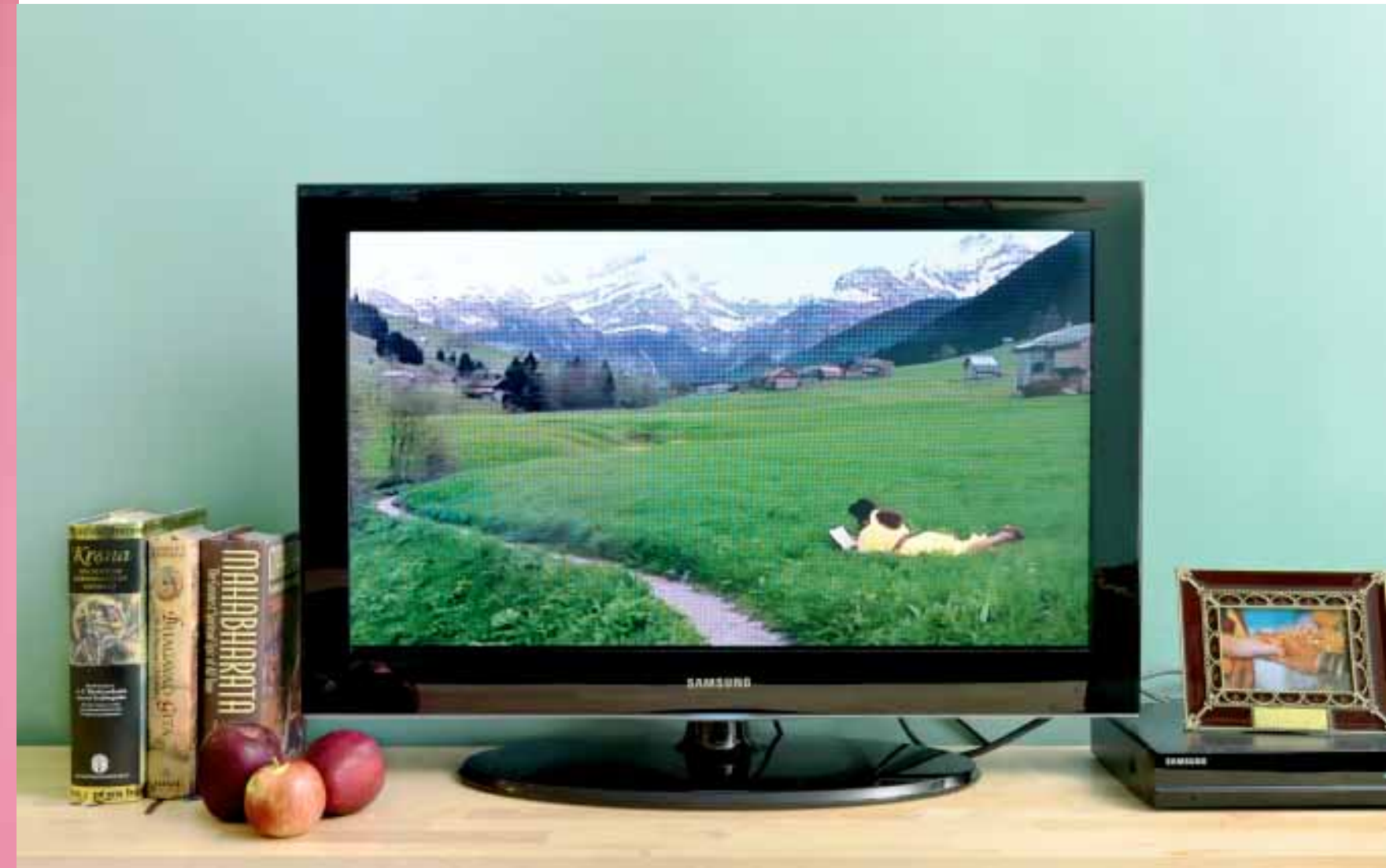
Above Kashmiri Landscape, Switzerland (Attorney St. and Houston St.), NY, 2010, cm 60,9 x 101,6, C-print. Left Camphor Flame on Pedestal (0432), 2010, cm 40,6 x 50,8, C-print. Page 18-19 4-Channel Blu-Ray Installation, (Production Still).