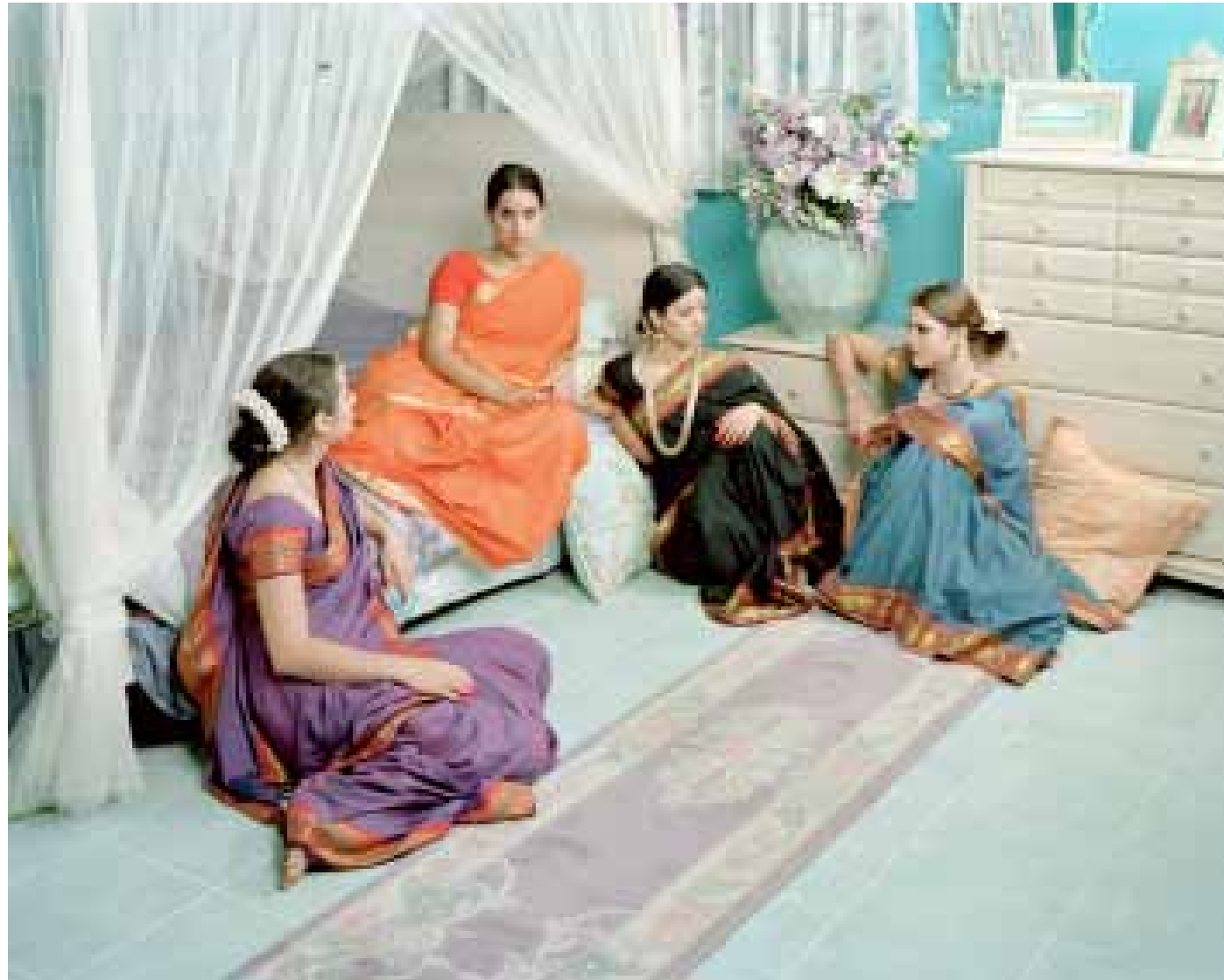
Pages 10-11 Kashmiri Landscape, Switzerland (Allen St. and Hester St.) NY, 2010, cm 60,9 x 101,6, C-print. Page 13 Women & Lychees, 2011, cm 40,6 x 50,8, C-print. Above Afternoon, Alachua, FL, 2008, cm 101,6 x 127, C-print. Right Men, Mango Leaves & Dates, 2011, cm 40,6 x 50,8, C-print